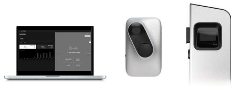
Load Guard sensor is delivered preconfigured, with the dedicated INCH charging station.